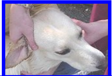
Photo showing a client massaging the ear canal.